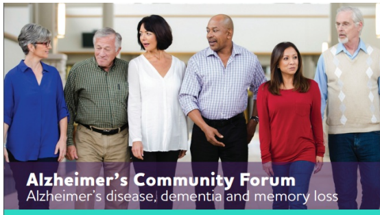
Alzheimer's Community Forum Alzheimer's disease, dementia and memory loss